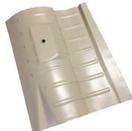
TF-S SIERRA TAN