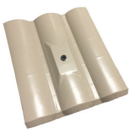
TF-W SIERRA TAN