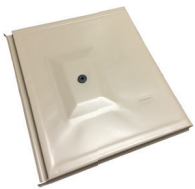
TF-FLAT SIERRA TAN