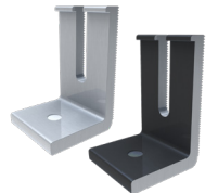
SCL-101-3 SCL-101-3 ANOD BLK