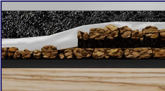
A layer of flexible foam pushes the sealant deep into the shingle's granules and around shingle steps