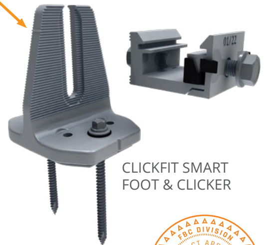
CLICKFIT SMART FOOT & CLICKER