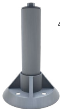
QB-1 Post 4.5" or 6.5", AL, Mill Finish