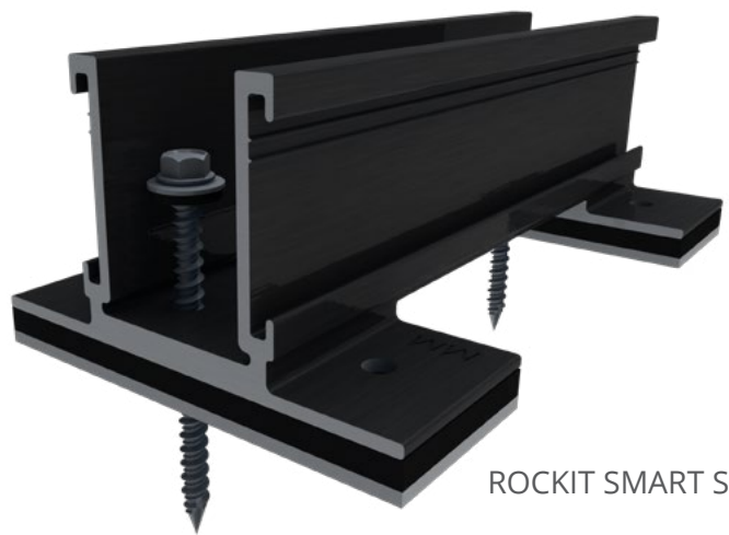
ROCKIT SMART SLIDE