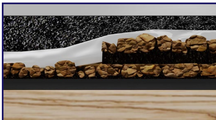
A layer of flexible foam embeds the sealant deep into the shingle's granules and around shingle steps