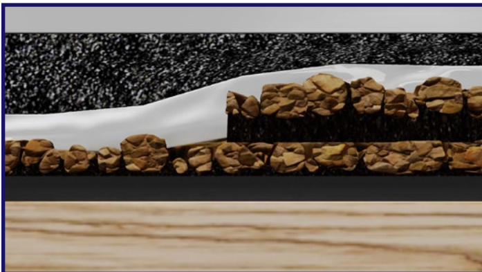
A layer of flexible foam embeds the sealant deep into the shingle's granules and around shingle steps