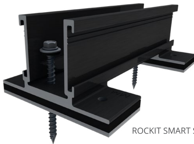
ROCKIT SMART SLIDE