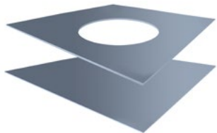
SimpleGrip Adhesive Top & Bottom