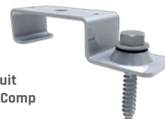
Conduit Bracket Metal