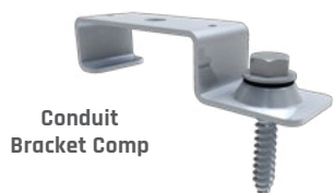
Conduit Bracket Comp