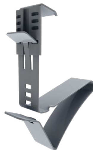
UNIVERSAL SIDE CLIP